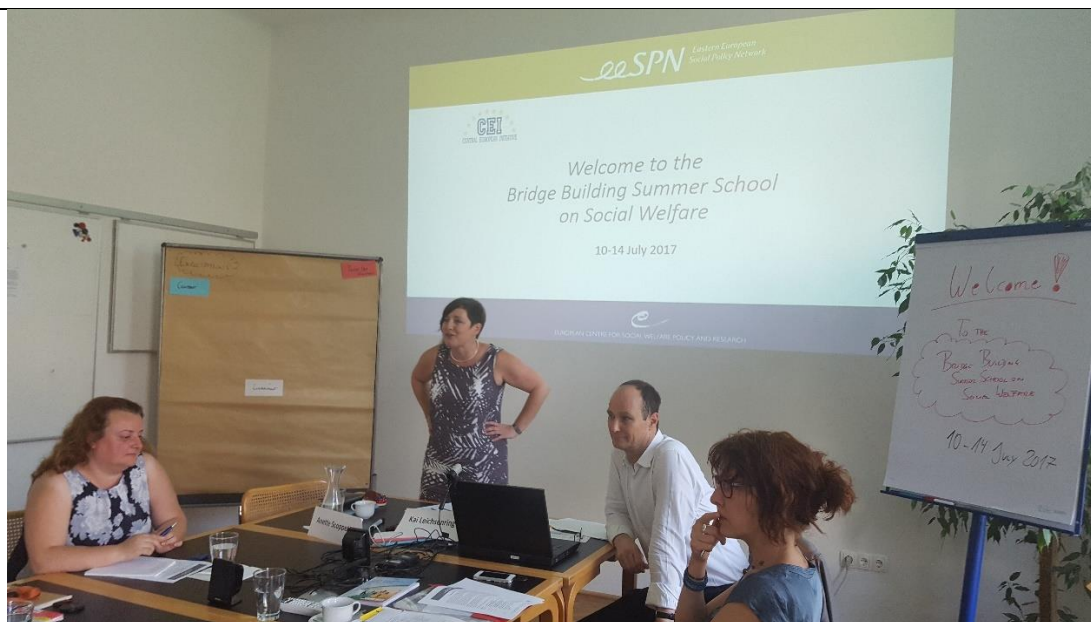
10 July 2017: Welcoming participants for the BB Summer School at the European Centre