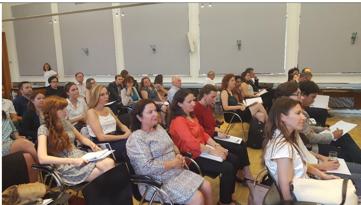
12 July 2017: Participation at the Austrian Federal Ministry of Labour, Social Affairs and Consumer Protection