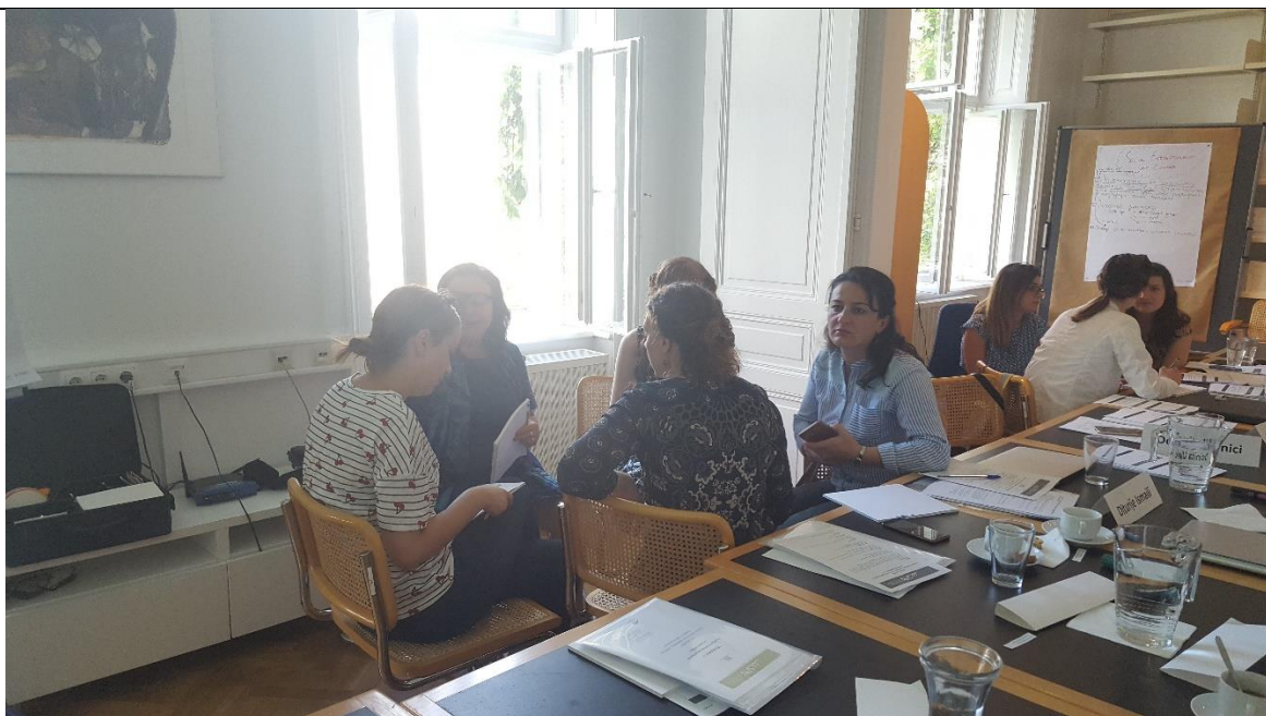
11 July 2017: Working in groups at the 'Marketplace' to enhance project ideas