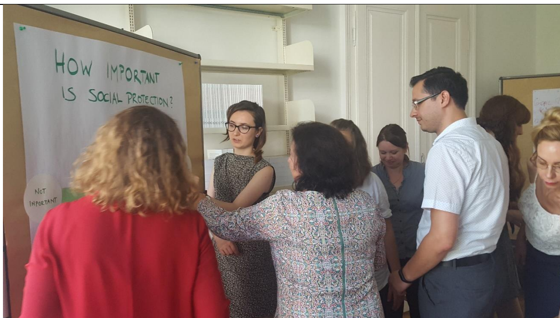
12 July 2017: Asking on 'How important is social protection?' during the input session of social protection

The summer school is co-funded by the Central European Initiative.